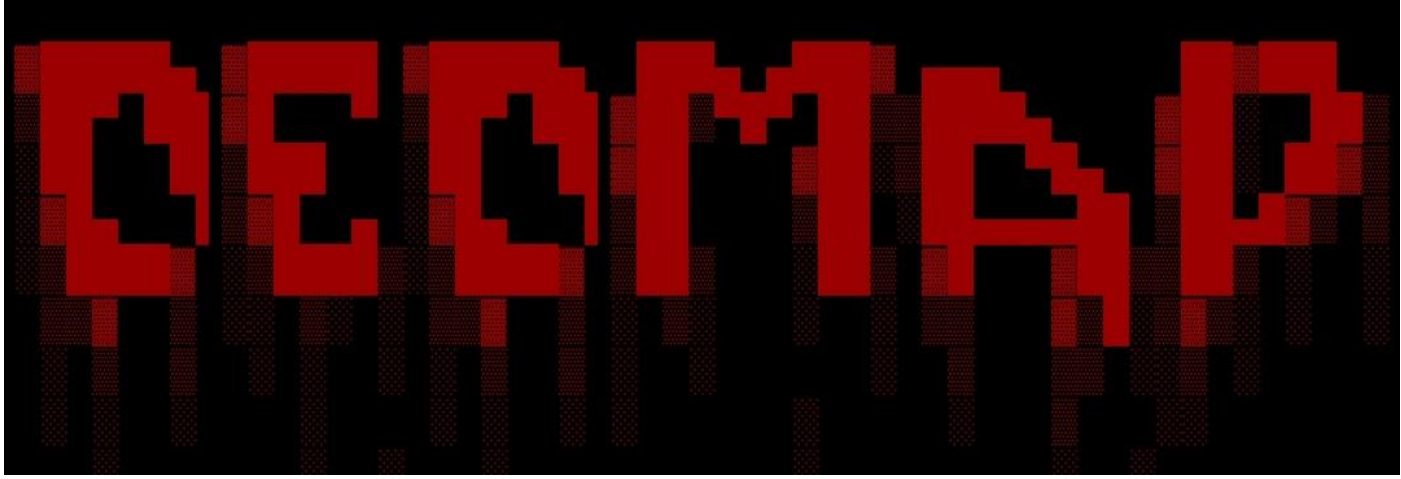
Figure 2: Logo of DEDMAP

Our tool is named DEDMAP and the logo is given below: